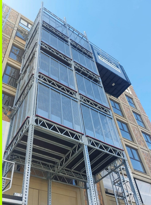
Grote Beer - Rotterdam (NL) Common Tower Lite

Call us today to talk to our experts about tailored solutions for your construction project.